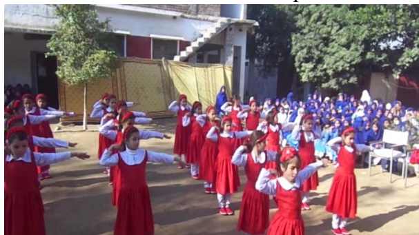
Students of GGPS Yaqoobi performing PT Show

The event was coloured with the performances of students in different activities which displayed