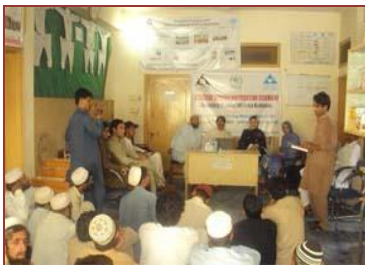
A view of Project Coordinator with the participants of the distribution ceremony