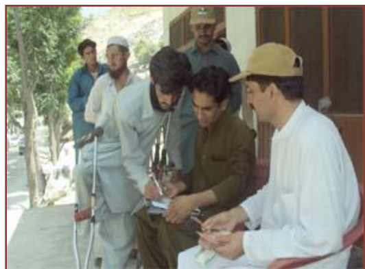
PWD receives wages compensation from SDF representatives