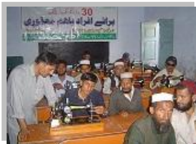
The Master Trainer is busy in guiding a PWD on the Sewing Machine

According to the training schedule, all the trainees were divided in to three groups and each group was containing of 15 PWD. The training was also divided into two portions i.e. theoretical and practical. Theoretically, they were to impart training regarding the course outline which was agreed upon between the SDF and Master Trainers.