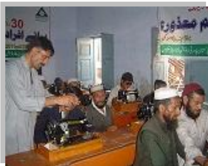
The Master Trainer is busy in guiding PsWD during the practical session of the training.