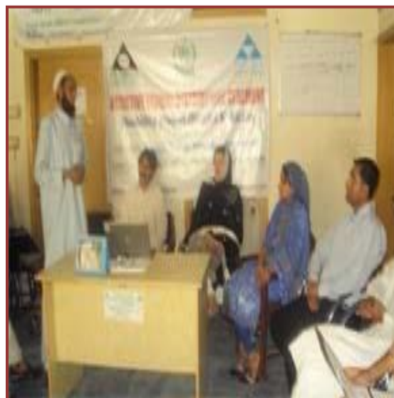
EDO Social Welfare addressing in the distribution

He said that Salik Foundation has completed its project activities nicely and with full coordination