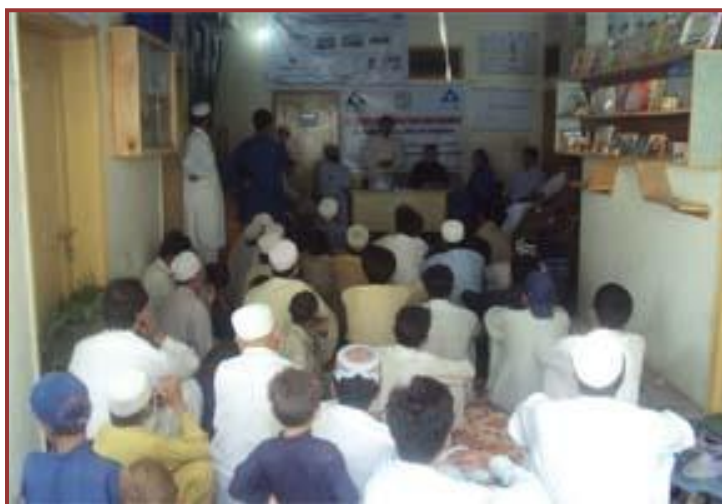
A view of Admin Salik Foundation with the participants of the ceremony

At the last he requested to the people to work collectively for the social development of Kohistan to alleviate the poverty and raise the living standards of the district.